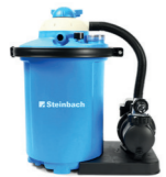
040100 Filteranlage Comfort 75