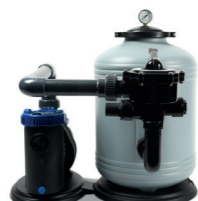
041020 Filteranlage SM 12