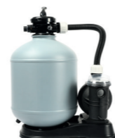
041015 Filteranlage Eco Top 10