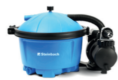
040220 Filteranlage Active Balls 50