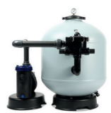
041024 Filteranlage SM 16