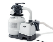
126646 Krystal Clear Sandfilteranlage SF80220-2