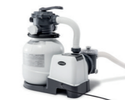
126646 Krystal Clear sand filter unit SX2100