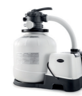
126680 Krystal Clear Sandfilteranlage & Salzwassersystem ECO20220-2