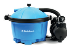
040220 Filter unit Active Balls 50