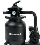
040385 Filteranlage Classic 250N