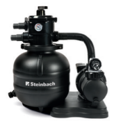
040310 Filteranlage Classic 310