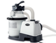
126644 Krystal Clear Sandfilteranlage SF90220-1