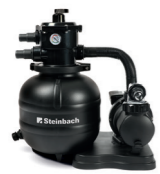
040310 Filter unit Classic 310