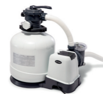
126652 Krystal Clear Sandfilteranlage SF60220-2