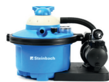
040200 Filteranlage Comfort 50