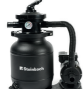
040386 Filteranlage Active Balls+