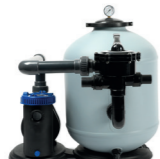
041022 Filteranlage SM 14