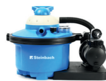
040200 Filter unit Comfort 50