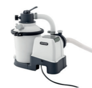
126642 Krystal Clear Sandfilteranlage SX925