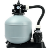
041010 Filteranlage Compact 8