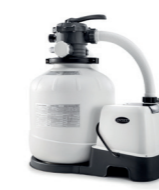
126680 Krystal Clear sand filter unit & saltwater system CG-26680