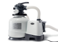
126648 Krystal Clear Sandfilteranlage SF70220-2