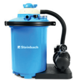
040100 Filter unit Comfort 75