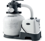
126676 Krystal Clear Sandfilteranlage & Salzwassersystem ECO15220-2