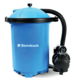
040120 Filteranlage Active Balls 75