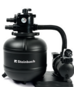
040340 Filteranlage Classic 400