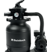
040386 Filter unit Active Balls+